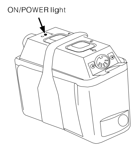
Figure 1. COM2000BP COMMUNICATOR®